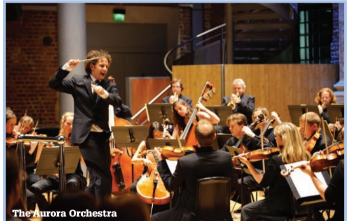
The Aurora Orchestra