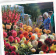
Shows & Events